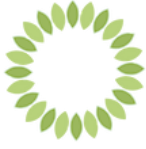
Carbon Emissions per category %